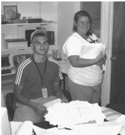
Enonee Baptist Church youth help with office work.

"I never took care of my health the way I should have before coming to Prodigals. I became enrolled with Healthcare Access and started going to regular checkups with a doctor. During one of my checkups my doctor saw a growth in my colon which ended up being cancer. We detected the cancer early and I had surgery quickly to remove the tumors. The doctors removed all of the cancer and said I was lucky to have found it in the early stages. I believe if I wasn't part of the Healthcare Access plan, I wouldn't have been seeing a doctor regularly and would still be unaware of the fact I had cancer, or dead."